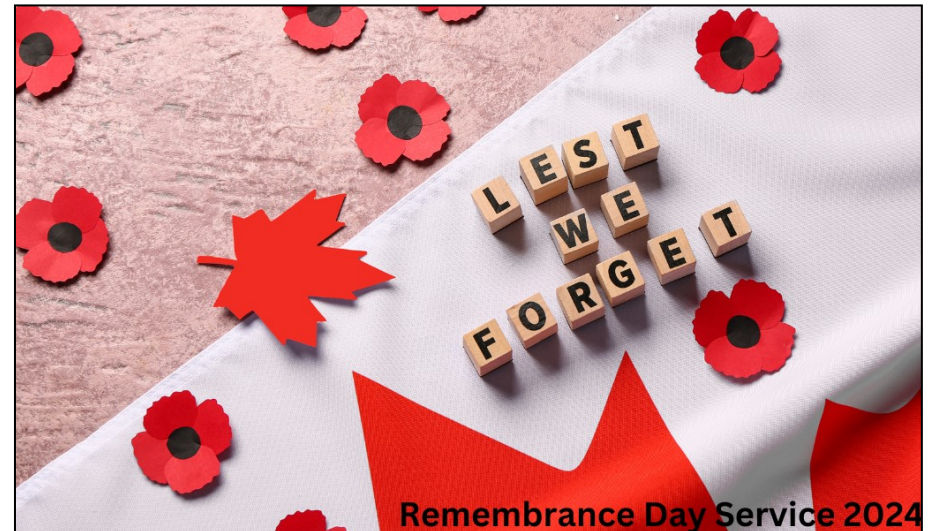
Remembrance Day Service 2024